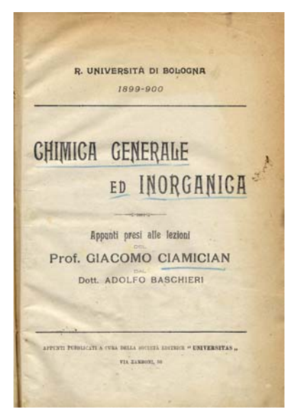
Figure 3. Front cover Baschieri's notes.