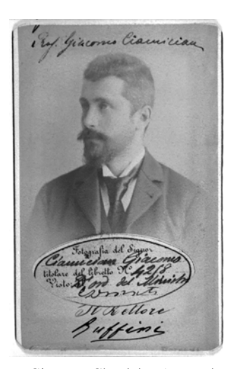
Figure 1. The young Giacomo Ciamician (approximately 1890).

investigations while the century ended, the WW1 took place, the peace returned, and so on. During the last few years of his busy life he finally devoted himself to promoting the building of new premises for the classrooms and chemistry laboratories of the University. However, even though he took active part in their design and witnessed the start of the work, he was unfortunately not fated to see its completion.