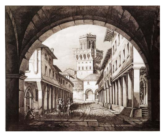
Figure 2. Bologna, S. Sigismondo Alley (University Quarter). Engraving by Antonio Basoli (1774–1848).